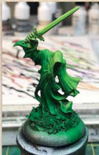
Tonal zones blocked out.

I started with the areas I wanted to be the brightest – the head, shoulders, arms, and upper torso – using 09415 Dungeon Slime . Once those areas were blocked in, I blocked out the darker areas – the lower torso and base – with 09410 Dragon Green . This gave me a highlight zone and shadow zone. From there, with the airbrush I added one additional highlight zone with 09287 Neon Yellow and an additional shadow zone with 09226 Peacock Green . These steps gave me a quick basecoat that had established highlight and shadow zones.