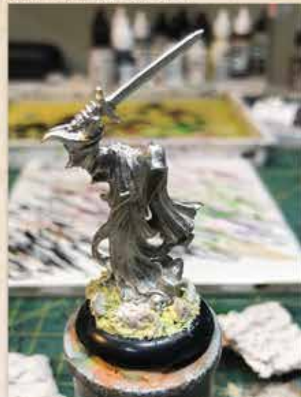
Milliput and hardened clay attached to the base.