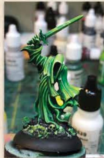
Using a glaze can help clean up your blends.

and eventually using Dragon White as the final highlight. Just like in the dark shadows I really tried to punch up the highlights to go for a strong contrast. In a few cases I made my highlight areas smaller by using Dungeon Slime and also using a 50/50 mix of Dungeon Slime and Dragon Green . There was a lot of back and forth getting smoother blends but towards the end I used a very diluted mix of 09096 Clear Green to apply a very thin glaze over the midtone areas. This glaze helps to further clean up the blends.