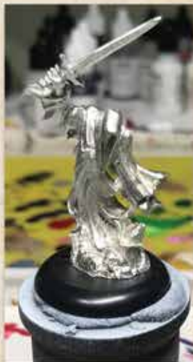
The Cairn Wraith based and cleaned.

Painting the Cairn Wraith - For the Cairn Wraith I wanted to convey a ghostly, green glowing effect, almost as if he were rising straight from the rocks at his feet. This effect isn't a traditional OSL effect but rather more of an internal glowing effect so that the leading edges of the mini have the most intense brightness, getting darker near the center. In addition, I wanted to go for a total monochromatic effect and chose green to get the maximum spookiness from the model. When using a glow effect, contrast is key to making it look believable.