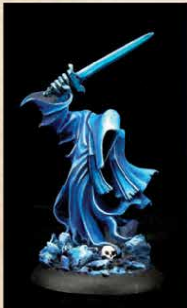
The Cairn Wraith in blue.