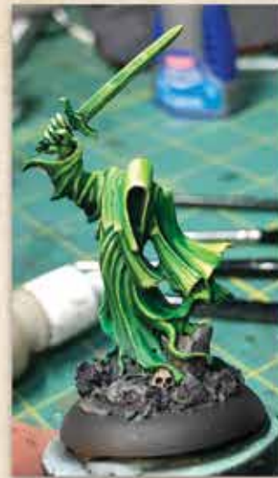
Shadows and Highlights applied.

For my highlights, I chose Neon Yellow again to refine the highlight areas, gradually increasing the brightness by mixing in 09439 Dragon White with the Neon Yellow